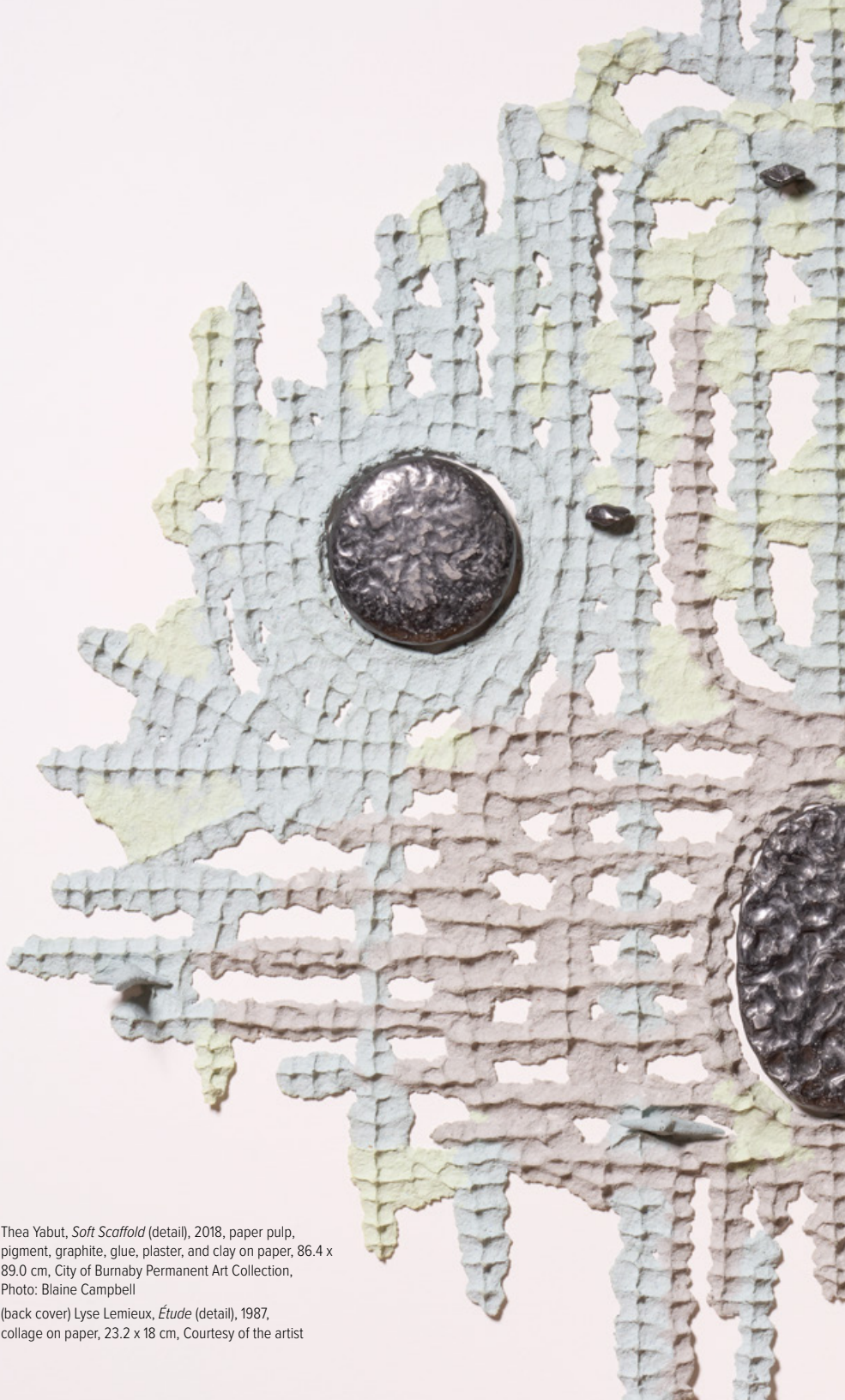
Thea Yabut, Soft Scaffold (detail), 2018, paper pulp, pigment, graphite, glue, plaster, and clay on paper, 86.4 x 89.0 cm, City of Burnaby Permanent Art Collection, Photo: Blaine Campbell