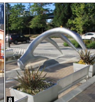
Shed and Blacktail. MUSE ATELIER. The elegant and elemental form of deer antlers were the inspiration behind these oversized aluminum sculptures. Sited on the Beresford Street Art Walk on Silver Avenue and Telford Avenue, they appear as if naturally shed.