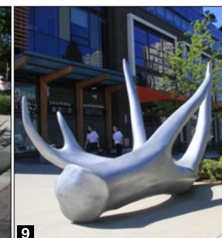
Dolphins in Unison. ERIC VANDERZEE. This metal sculpture was installed in 1989 for the opening of the Eaton Centre, now Metropolis at Metrotown.