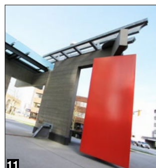
Untitled. ALAN STOREY. This aluminum and concrete sculpture is on the corner of Nelson Avenue and Bennett Street.