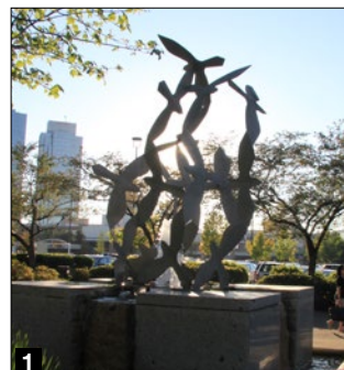
Birds. GERRY GLADSTONE. This bronze sculpture/fountain is located near the corner of Nelson and Kingsway

Public art can be found throughout Metrotown, from the Korean War Memorial in Central Park, to the "Water Spheres" installation at Royal Oak Avenue and Dover Street. In Metro Downtown (Walk #4), there is an emerging "Art Walk" along the south side of Beresford Street, between Willingdon Avenue and Dow Street. This includes sculptures, a digital panel, and a programmable/curated digital screen. The aim of the public art is to create a distinct sense of place that encourages people to linger, eat, shop and explore. Below are a few examples of art found throughout Metrotown. The numbers on the photos correspond to numbers on the map.