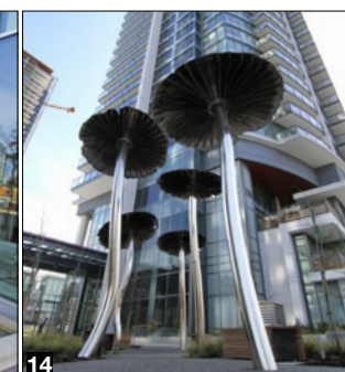
Lanterns at the Park. IE CREATIVE. The five lanterns comprise a "fairy ring" ensemble of stainless steel mushrooms. Located on Nelson Ave. south of Bennett St.