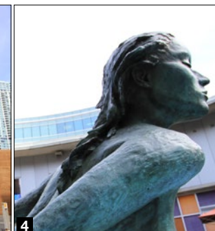
Aurora. COLIN KWOK. This bronze sculpture/fountain is located in the outdoor pedestrian corridor of The Crystal Mall.