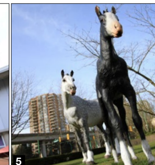
Evangeline and Bay B  b  . JOE FAFARD. These realistic looking bronze powder-coated horse sculptures are located in the Metrotown Library grounds.