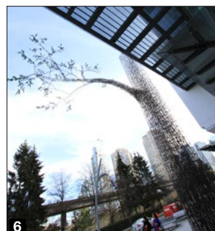
Old Column. LEAD PENCIL STUDIO. This is a 3-dimensional sketch of a tree becoming a section of lumber. It is located on Beresford Street at Willingdon.