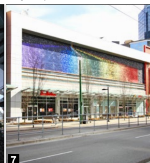
Say Nothing in Bright Colours. INSTANT COFFEE. This shimmering sequin mural is on the north side of Central Blvd at Station Square.