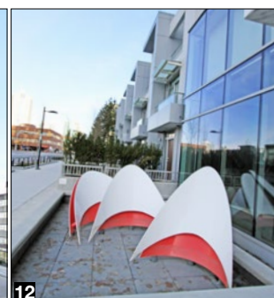
Bloom. JILL ANHOLT. Inspired by the opening of Lotus flowers, these aluminum sculptures are located on Nelson Ave. south of Bennett St.