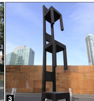
Chair Column. AL MCWILLIAMS. At 15 feet tall, this stack of steel chairs seems to defy gravity. It is located on Silver Avenue in Station Square.