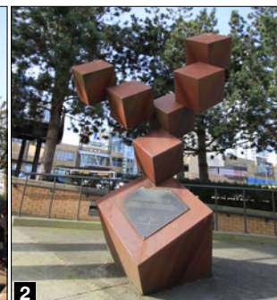
Cubes. UNKNOWN ARTIST. This steel sculpture salutes volunteers and volunteering in Burnaby. It is located on Kingsway, east of Sussex Ave.