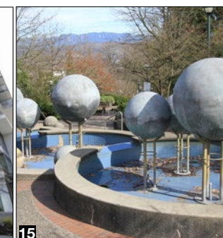
Water Spheres. TONY BLOOM. These nine aluminum spheres represent planets within a central axial pool in a water reclamation park. Located on the northeast corner of Royal Oak and Dover.