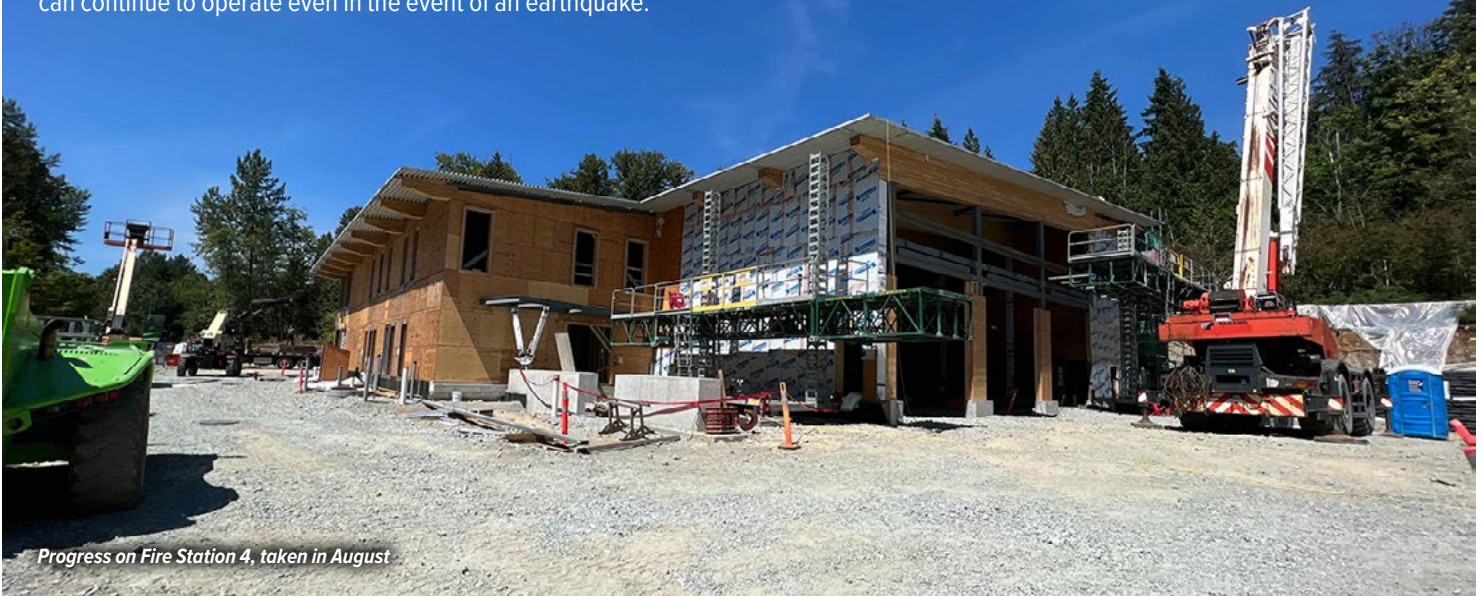
Progress on Fire Station 4, taken in August