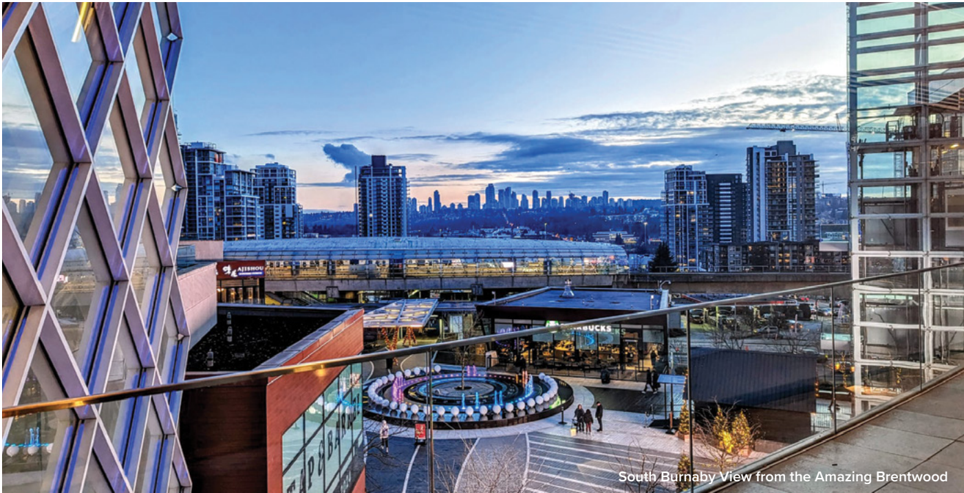
South Burnaby View from the Amazing Brentwood